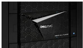
VMAX All Flash

The exciting Dell EMC VMAX All Flash family offers the VMAX 250F and VMAX 950F arrays. The VMAX 950F delivers unparalleled performance and scalability as a mission-critical multi-controller platform utilizing Intel® Xeon® E5-2697-v4 18 core processors running at 2.3GHz. With the highest capacity 7.68 and 15.36TB Enterprise Flash drives, and Dual V-Brick/cabinet packaging this new Enterprise class array offers a compelling value proposition designed for the most demanding storage workloads, including new support for Mixed Mainframe and Open Systems hosts. Like all members of the All Flash family, your data always resides in the fastest possible tier (Diamond) to deliver the highest IOPS throughput and lowest possible latency. PowerMaxOS with service levels is an attractive option for VMAX All Flash customers.